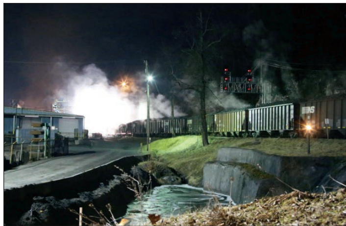
SunCoke-NS Coke loading on February 6, 2014

The annual banquet will begin at 6:30. The banquet will be buffet style and will consist of beef bourguignon (beef tips braised in a red wine gravy), roasted Hawaiian chicken, rice pilaf, mashed potatoes, southern style green beans, dinner rolls, chef's choice of dessert, tea, coffee, water. Cocktails and soft drinks can be purchased at the bar. Entertainment by Coaltown Dixie.