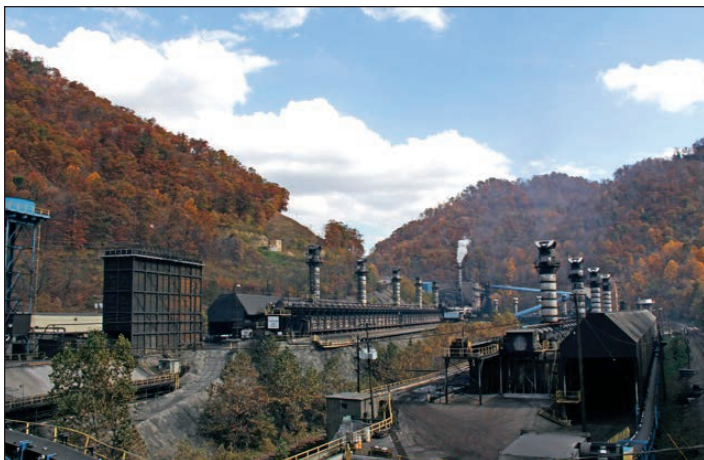
Coal & Coke Plant in Vansant, Virginia Oct 25, 2012

the N&W Levisa Branch to its junction with the Buchanan Branch main line at Weller Yard, VA. Then continuing east and following the N&W line through the town of Grundy, VA past the Dismal Yard, we will arrive at the coke plant. The plant has been in operation since 1960. This facility heats metallurgical coal in large scale, specially designed ovens to more than 2000 degrees Fahrenheit. This leaves behind a carbon rich product called coke. The coke is shipped on the former N&W (now Norfolk Southern) Buchanan Branch to steel mills where it is mixed with iron ore and other elements and heated again in a blast furnace as part of the steel making process.