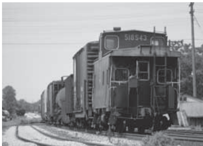
Above: N&W caboose 518543 in the blue scheme trails an eastbound freight on June 1, 1974, north of AC Tower approaching the small yard at Marion on the Sandusky Line.

Morning: The annual membership meeting will be held at the Holiday Inn Express on the east side of town to allow attendees to head home with the convenience of the highway nearby.