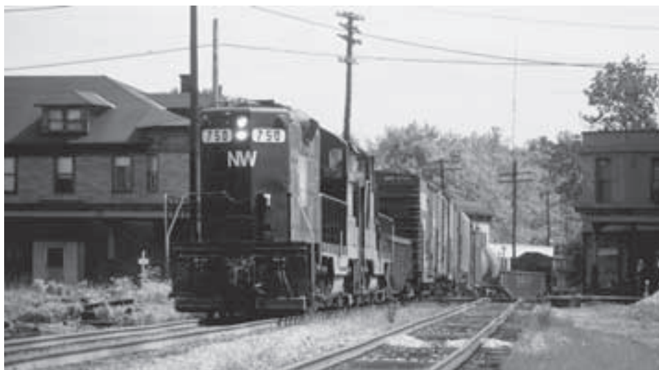
Right: GP9 750 hauls a manifest freight westbound past the Erie office building on the right and the "beanery" on the left on June 1, 1974. The beanery was the old Marion Depot hotel dating back to near the construction of the depot in 1902. The old PRR depot sat to the south of the hotel along the east side of the Sandusky Line. A corner of the PRR/N&W freight house pokes out behind the tank car.

Currently there are more than a dozen seminars in the works for this convention. We have everything from a railfan's introduction to Marion and its rich railroad history to underground coal mining. Seminars are planned on the Marion rail lines, the N&W/NKP/WAB purchase/lease, photo essays of historic and current rail activities in Ohio, modeling seminars, and seminars of particular N&W and VGN topics. If some of your photos don't quite meet your expectations we've also got a seminar on how to use PhotoShop so you can fix them up later. Hopefully there is something for everyone.