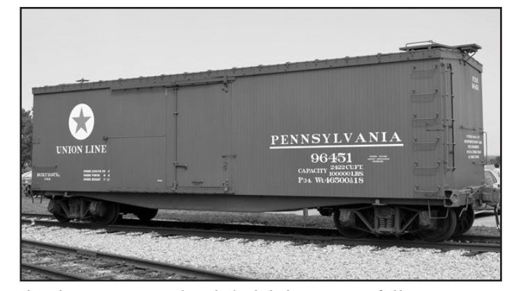
PRR 96451 was built by Pressed Steel Car Co. in 1907 for Subsidiary New York, Philadelphia & Norfolk.