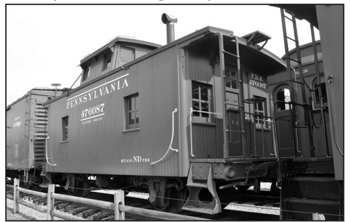
PRR 476087 "bobber" was built in 1910 and acquired in 1959.