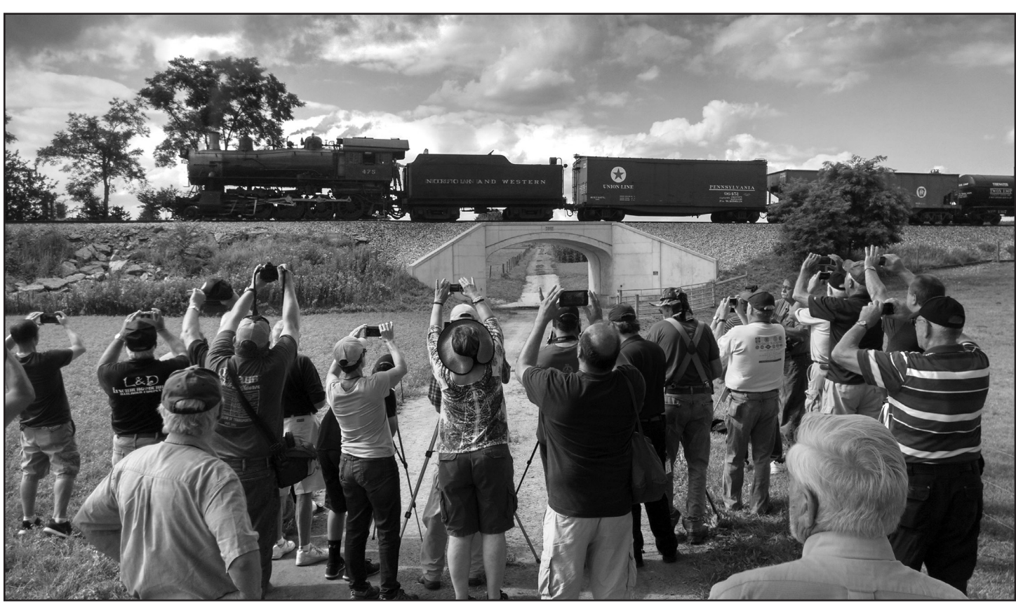
Norfolk and Western Historical Society, Talk Among Friends • Page 3