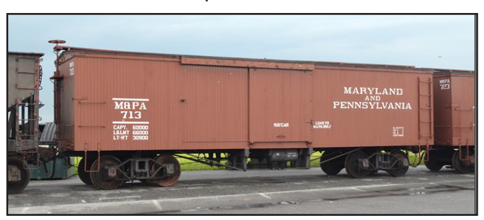
Ma & Ma 713 was built by the Baltimore Steel Car & Foundry in 1906 and acquired by SRR in 1960.