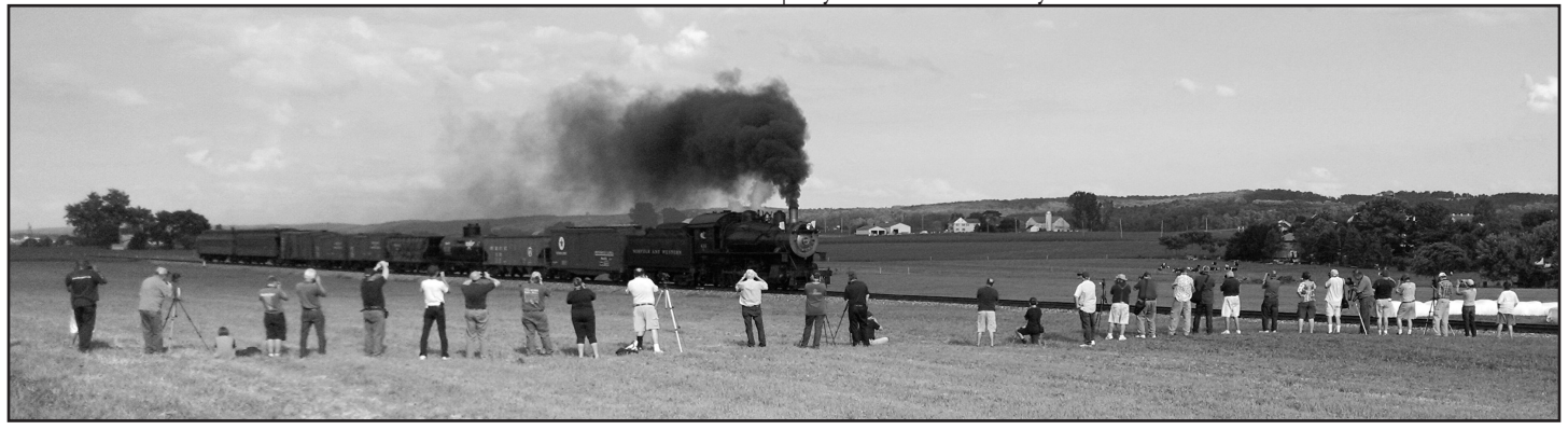
Page 2 • Norfolk and Western Historical Society, Talk Among Friends

And if you think Stasburg was good, just wait for next year! See that story elsewhere in this issue.