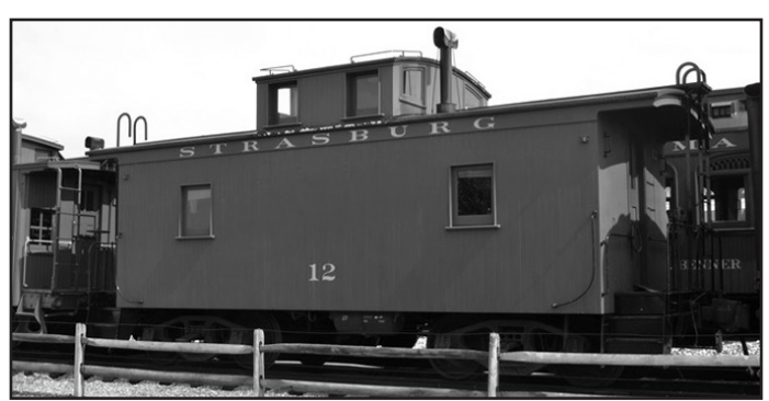
Cab 12 was built by the Baltimore Car & Foundry in 1925 for the Detroit, Toledo & Ironton as their no. 95. SRR acquired it in 1964.

North Carolina. West Jefferson, as many of you are aware, was the ending point (after being cut back from Todd, NC) of the famed Abingdon Branch.